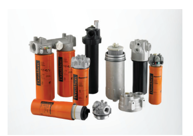
Medium Pressure Filtration