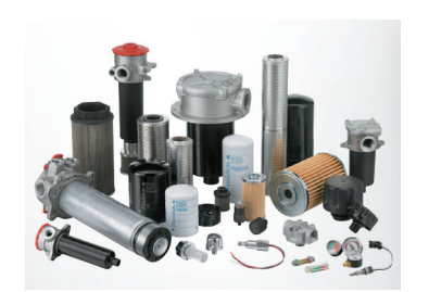
Low Pressure Filtration