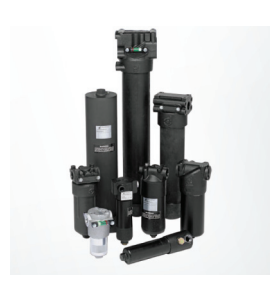
High Pressure Filtration