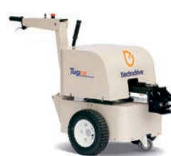
Tug Axis 1T & 2T 1 or 2 tonne load capacity.