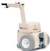
Tug Compact 500 kg load capacity.