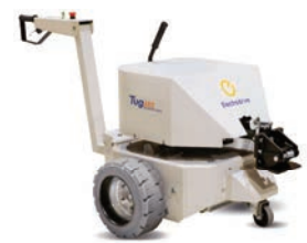
Tug Axis 4T & 5T 4 or 5 tonne load capacity.