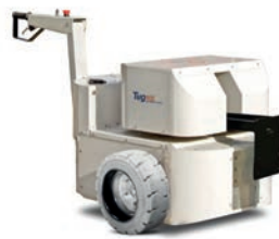
Tug Rise 1T 1 tonne load capacity up a 15° ramp.