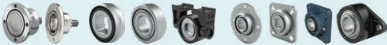
Agri Hub range Gang disc Seedbed finisher