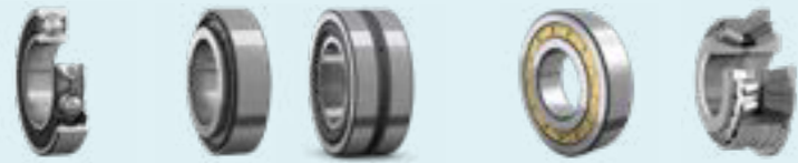
DGBB explorer TRB explorer CRB explorer Pinion unit