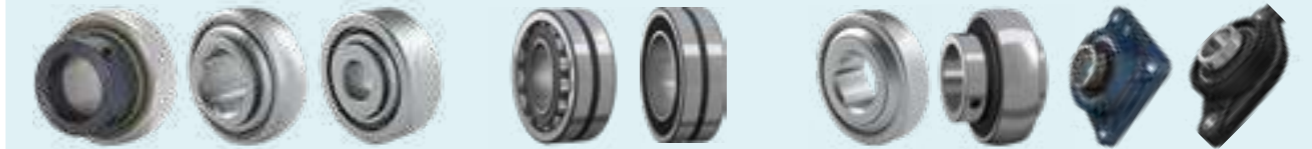
Head Feederhouse / Rotor Clean Grain / Residue