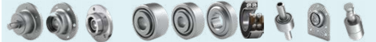
Agri HUB Disc opener Seedmeter drive shaft Gauge wheel