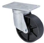
WZP Plate with swivel