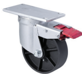
WZPTB Plate with swivel and total brake