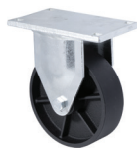
WZF Fixed plate, no swivel